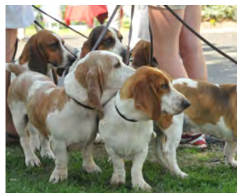
New Jersey Basset pack at rest before class