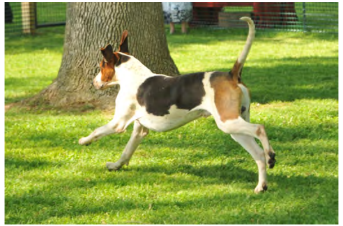
PMD Arjay showing at Liberty