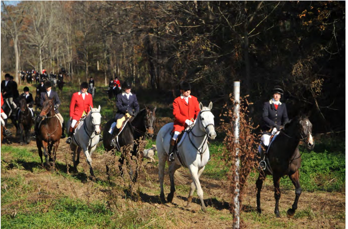
Opening Meet 2011 photographs contributed by Tony Shore